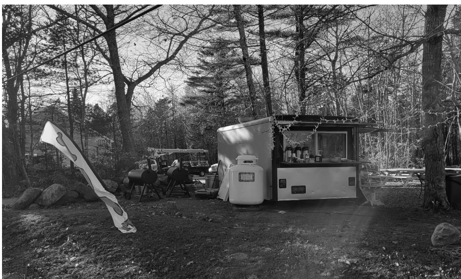
FatRoll Food Truck, located at Fresh off the Farm 495 Commercial Street