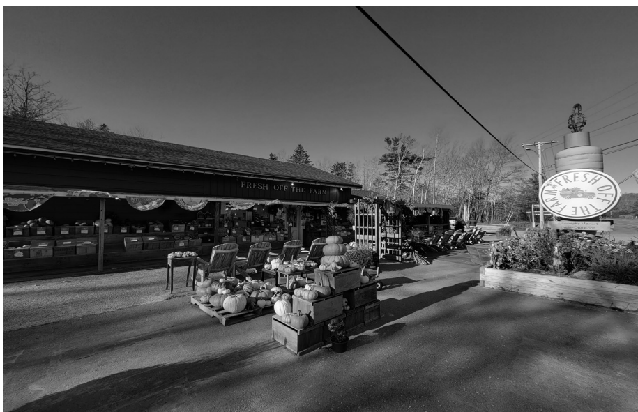
Fresh off the Farm located at 495 Commercial Street

FatRoll Food Truck serves breakfast and lunch. specializing in house-smoked local meats and using as many Maine ingredients as possible. FatRoll Food Truck is open from 7:00 a.m. to 11:00 am for breakfast and 11am to 3pm for lunch, Monday through Saturday. The owner, Melanie Daigle says "We are still finding our way and finding what works, but the response to our food has been amazing!". Go to FatRoll Food Truck on Facebook for their menu and daily specials.